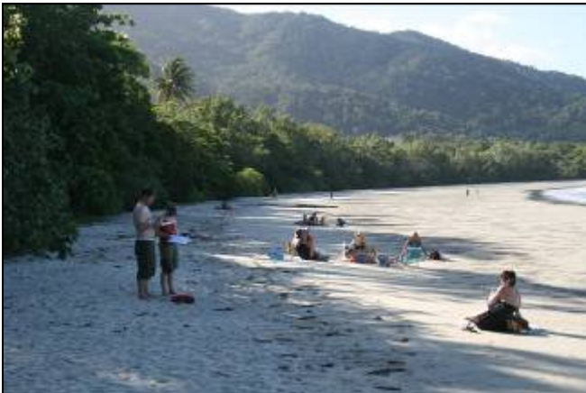
Image: Site level surveys at Kulki in November 2008.